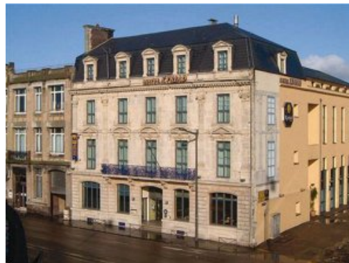
Hotel in Rouen, France

*Should increase over the summer since I will be working before I leave.